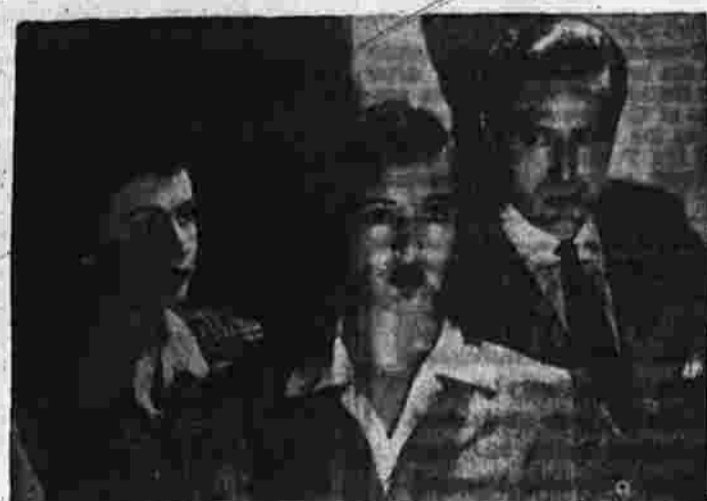
Starting as a scream in the night, "The Uninvited," starring Ray Milland, Ruth Hussey, Donald Crisp with Cornelia Otis Skinner, Dorothy Stickney playing at the State Sunday, Monday and Tuesday.

force, the other nations could not over-ride the decision.